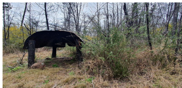
FIGURE 2 Upward (2022). Goonoowigal State Conservation Park [Photograph]. [Unpublished PhD Thesis Photograph] University of New England.

genetically unique for that specific region. Therefore, without prior conservation efforts to gather seeds from these local species of vegetation, there is a chance that the loss of these distinctive plants will result in their extinction from this area. I'm not sure if this is the case for Goonoowigal, as I have not had a chance to talk to any local Nurseries, but I can only hope that local groups had the chance to preserve the history of their unique regional flora before the bushfires swept through.