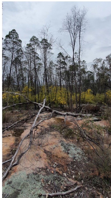
FIGURE 1 Upward (2022). Goonoowigal State Conservation Park [Photograph]. [Unpublished PhD Thesis Photograph] University of New England.

From our conversation, it is my understanding that each pocket of bush medicine and bush tucker plants is