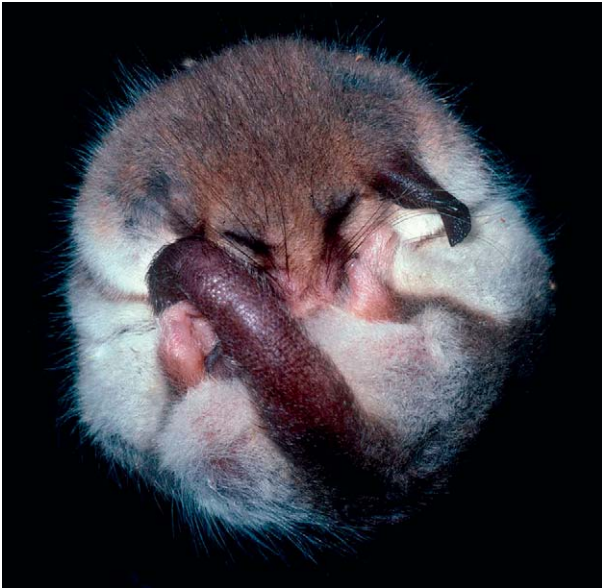
Figure 3 A hibernating pygmy-possum ( Cercartetus concinnus ) curled into a tight ball to minimise the body surface area. Note: the animal has been turned over to show the position of appendages.

some species such as chipmunks use stored food in addition to fat to get them through the winter. Whereas hibernation is mainly used by adult animals to survive the winter, recent evidence has shown that bats may use it to prolong the gestation period during adverse conditions in spring to delay parturition until weather and the chances for neonate survival improve (Willis et al. , 2006).