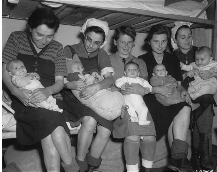
Figure 4. Group portrait of five Hungarian Jewish mothers and their infants in a Dachau sub-camp in Germany.