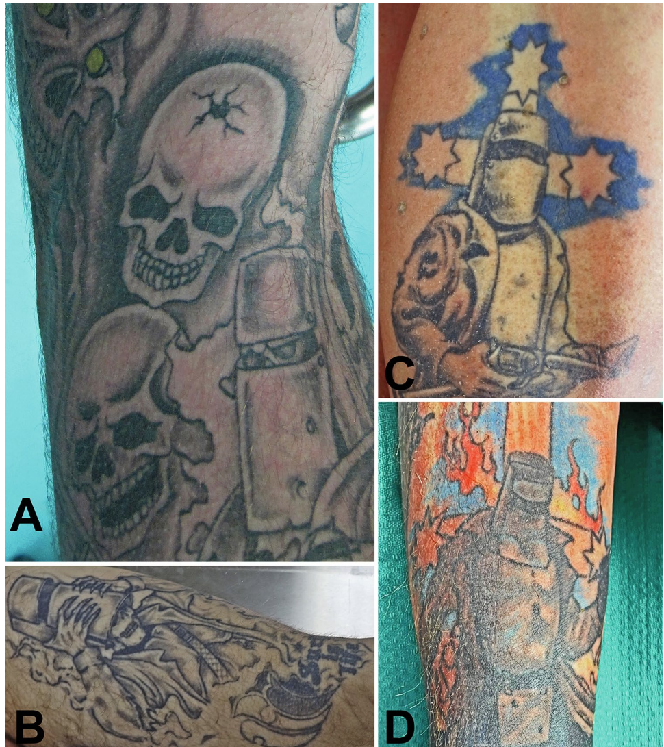
Fig. 4 A tattoo of Kelly with skulls, one of which has a bullet hole in the cranium (A), one with his skeletonized head being revealed as his helmet is being removed (B) and another with a backdrop of the Eureka flag which is now used for racist purposes (C). In the final tattoo, the burning cross of the Eureka flag has been carefully positioned to suggest the crucifixion of a martyr or the flaming cross of a crusader (D)

accidents (23.7%) and 4 homicides (10.5%). Of the 19 suicides and homicides, there were 19 males and no females, with ages from 24 to 57 years (average 44 years).