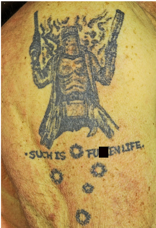
Fig. 5 Augmentation of “Such is life” with an expletive (partly covered)

commonly associated with membership of criminal gangs [20, 21]. In more recent years, the practice has gained wider social acceptance, and tattoos are now popular at all levels of society involving for example an estimated 10–16% of teenagers [22, 23].