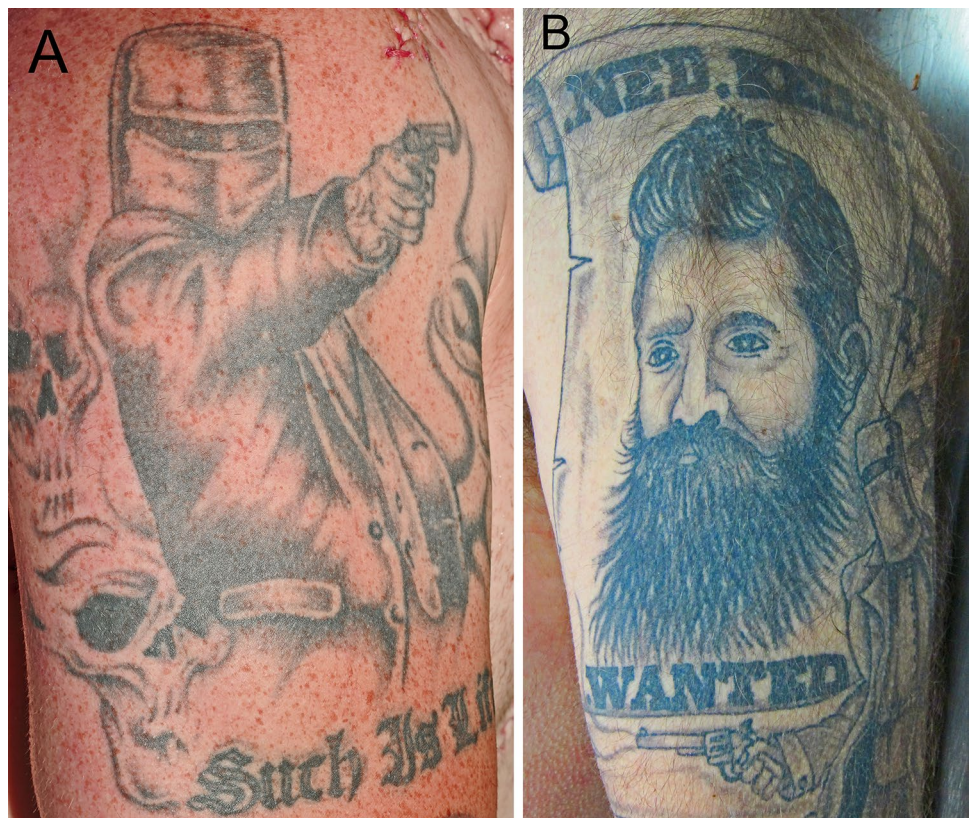
Fig. 2 A quite sophisticated fine line tattoo depicting Kelly with his alleged last words (A) and a fine line portrait (B)

A recent analysis of Kelly’s behaviour has also revealed disturbing trends with an assessment by a psychiatrist suggesting that Kelly was psychopathic and guilty of “pathological lying, callous lack of empathy for others and a parasitic lifestyle” [7]. Not only were his actions and police record