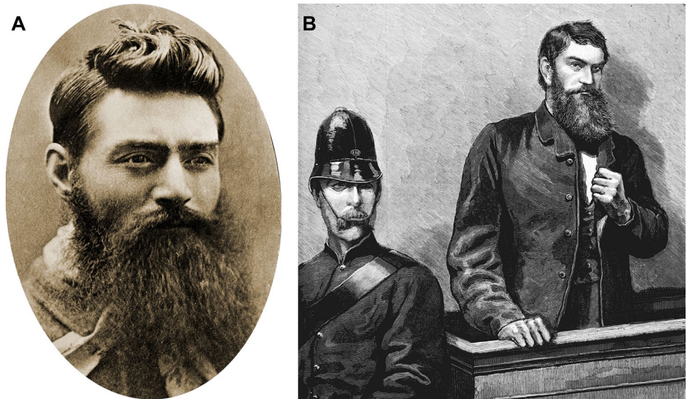
Fig. 1 A photograph of Ned Kelly taken in 1880 A and a woodcut of his trial in Melbourne B

wounds would have occurred with fewer projectiles. This phenomenon was confirmed at a police firing range in the “Lawless – The Real Bushrangers” documentary series where a replica of Kelly’s gun was tested [5]. However, this does not address the question as to why Kelly scored his bullets in the first place. Such altered bullets are called “expanding bullets” and are known to fragment on hitting a target