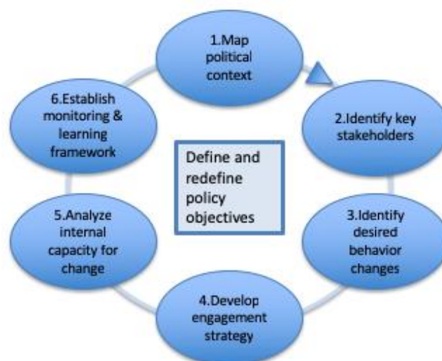
Figure 1. Adapted version of the ROMA model used by the SHIELA project (Tsai et al. , 2018) and by Hainey et al. (2018).

This was conducted through a series of semi-structured interviews, focus groups and workshops with members of the University Senior Leadership Team (n=12), Faculty Deans and Associate Deans, academic and professional staff of the University Faculties and Central Service Units (n=39), and students (n=6). The data collected was analysed along the six dimensions, of: (1) mapping of (political) context; (2) identifying key stakeholders; (3) identifying desired behaviour changes; (4) developing an engagement strategy; (5) analysing internal capacity to effect change; and (6) establishing monitoring and learning frame-works (as demonstrated in Figure 1). All data was validated by the LA roundtable group (see details below).