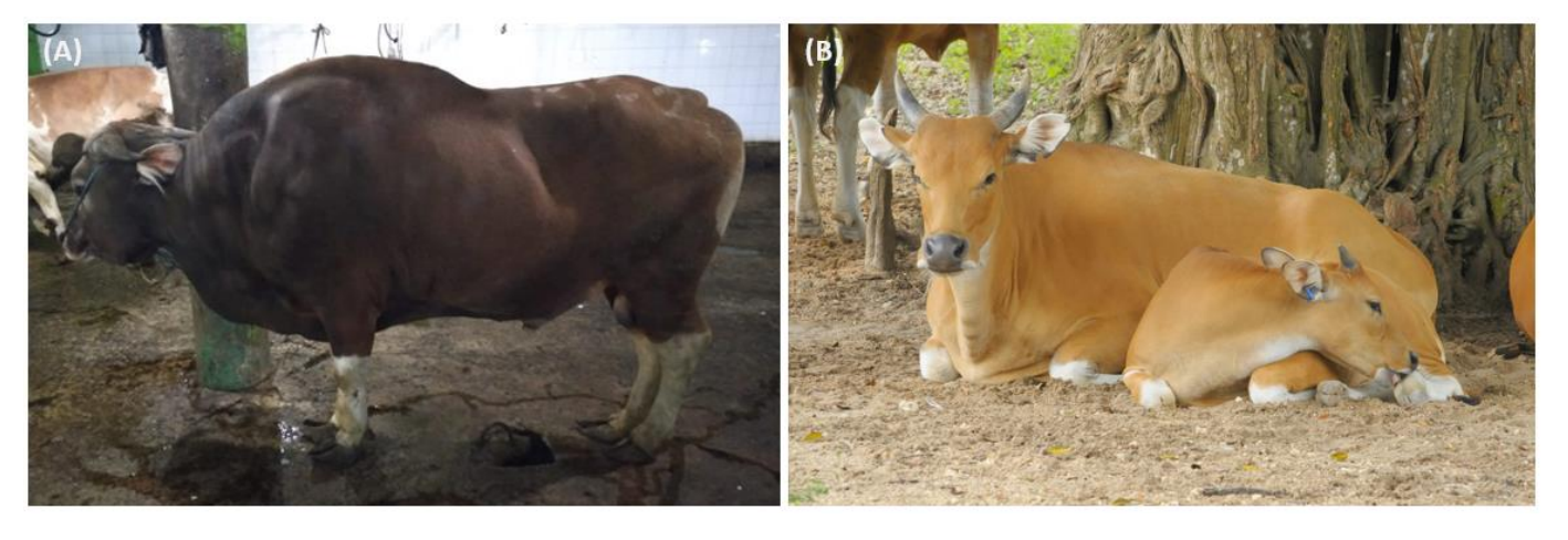
Figure 1. Images of Bali ( Bos javanicus ) breed animals: ( A ) Bali bull at final weight prior to slaughter; and ( B ) Bali cow and calf.

Nowadays, Bali cattle populations are spread across the Indonesian archipelago, mainly in the islands of Bali, Sumatra, Kalimantan, Java and East and West Nusa Tenggara. In Bali, they are managed in intensive and semi-intensive systems, whilst in Sumatra and Kalimantan they mostly integrated with palm oil plantations. In East and West Nusa Tenggara they are reared on a mix of intensive (cut-and-carry, stall-based) and extensive pasture systems [29].