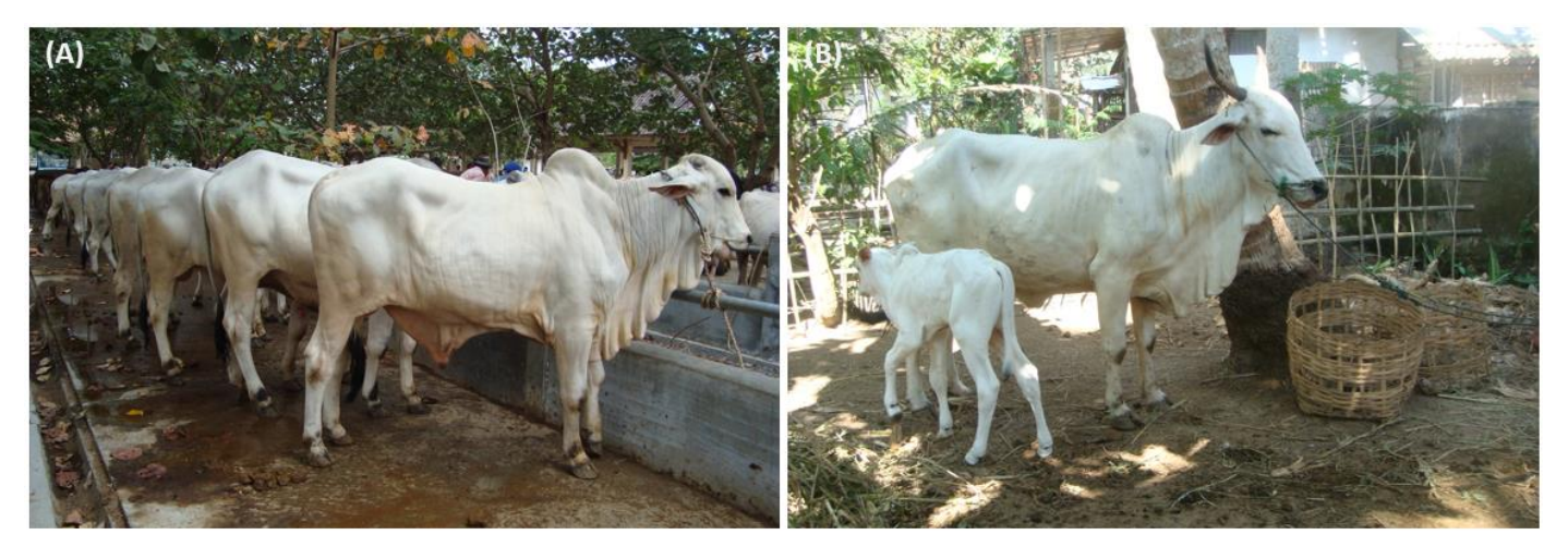
Figure 2. Images of Ongole grade ( Bos indicus ) breed animals: ( A ) Ongole bulls in a traditional Indonesian cattle market; and ( B ) Ongole cow and calf.

Peranakan Ongole cattle (PO) are derived from Ongole or Sumba Ongole [33]. Towards the end of the 19th century, several Indian Bos indicus breeds were imported into Indonesia for use as dual-purpose, draught/beef animals, with the Ongole (known elsewhere as Nelore) deemed the most suitable [28]. Hence, around 1914 all purebred Ongole cattle in Indonesia were sent to the Island of Sumba, where they were managed as a purebred herd, with the herd gradually expanding and purebred Ongole bulls subsequently exported from Sumba to other Indonesian islands to be used for crossbreeding purposes [28]. Ongole cattle are a specific breed from within the Bos indicus species, though a recent study [34] found that Bos javanicus contributes about 6–7% of the average breed composition of PO cattle. PO cattle are now mainly found in the island of Java (90%), with the remainder located in Lampung, South Sumatra, North Sumatra, Central Sulawesi and North Sulawesi provinces [35]. PO cattle were developed for draught purposes. Hence, they are large with strong bodies (Figure 2) as well as being docile and tolerant to heat and other environmental stressors [27], though again there are no scientifically valid comparisons relative to other cattle breeds.