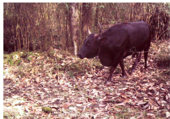
Figure 2 A free-ranging bull foraging in the deep jungle, far away (about 3 km) from human settlement

Of the total cattle encountered in the nearby forests, only 14.3% ( n = 150 ) were accompanied by herders (Figure 3), with the rest 85.7% ( n = 900 ) left to range freely. All 10 horses freely grazing in the forests were also not accompanied by herders. More than 80% ( n = 120 ) of those cattle accompanied by herders were situated closer to human settlements, mostly within 1.5-km distance from the settlement boundaries.