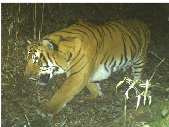
Figure 4 A male tiger caught on a camera trap at night after depredating a livestock in a forest surrounding Damji village of Khatoe Geog in Gasa Dzongkhag

Farmers lost 355 animals, mostly horses and cattle, during the period 2012 to 2014 to four main wild predators: 177 (49.9%) to dhole, 121 (34.1%) to common leopard, 38 (10.7%) to tiger (Figure 4), and 19 (5.3%) to Asiatic black bear Ursus thibetanus . There was significant difference in the number of livestock killed by each predator ( H_{(3)} = 74.68, p < 0.005 ), largely driven by dhole. The number of animals lost to different predators differed between the geogs. For example, Lingmukha Geog lost most of the livestock to leopards while Genye, Khatoe, Khamoe, and Shengabjimi lost most of their livestock to dholes (Table 1). Predation losses also differed among