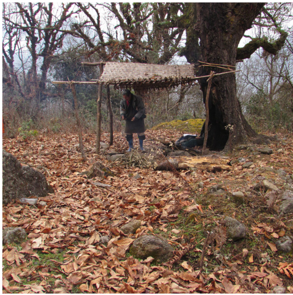
Figure 3 A cattle herder in Gasa Dzongkhag posing in front of his makeshift camp in a temperate broadleaved forest