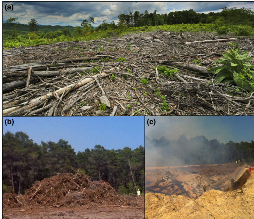
Fig. 2 In east Tennessee, much wood is left on the ground after a clear-cut where it decomposes and gradually releases carbon to the atmosphere (a). After a forest clearing in northern Florida, whole trees and residues are piled (b) and then pushed into a pit to be burned (c) resulting in immediate release of carbon into the atmosphere. Both practices are common across the SE USA. Note that the person on the right in photograph b shows the size of that pile.

ecosystem services (Meyer et al. , 2015). When residues are removed for bioenergy, economic and operational limitations, as well as BMPs, ensure that adequate woody debris remains on site to protect soil and water quality (Neary & Koestner, 2012; Evans et al. , 2013; Fritts et al. , 2014; Cristan et al. , 2016).