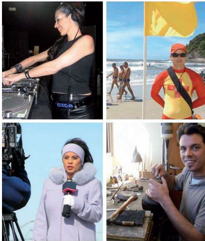
Fig. 13 Role play for job interview. “Global English,” by Polk-Reyes (2018, p. 122). Copyright Ediciones Cal y Canto