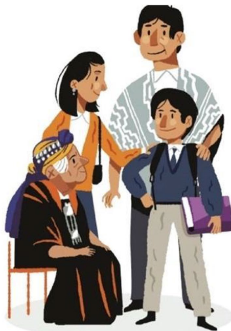
Fig. 5 Indigenous Groups. From “E-Teens 8”, by Curwen and Pontón (2013, p. 139). Copyright U.D. Publishing, S.A. de C.V

between the reproduction of traditional culture and participation in contemporary life. Kress and van Leeuwen (2006) argue that in Western societies, written language holds a primary position, resulting in the visual mode being subservient to language as a means of expression (p. 34). In the image presented, neither the visual representation nor the written language effectively support each other, as the written text alludes to historical events or practices of other indigenous groups. Consequently, the significance and potential meaning of the visual image in the coursebook become obscured.