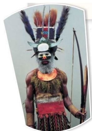
Australian Aboriginal man

While highlighting indigenous communities as custodians of traditional knowledge, beliefs, and values is crucial, their marginal representation in coursebooks indicates varying degrees of subtle or overt marginalization and racialization. Moreover, this phenomenon perpetuates what Holliday (2010) refers to as "otherizing," which occurs when