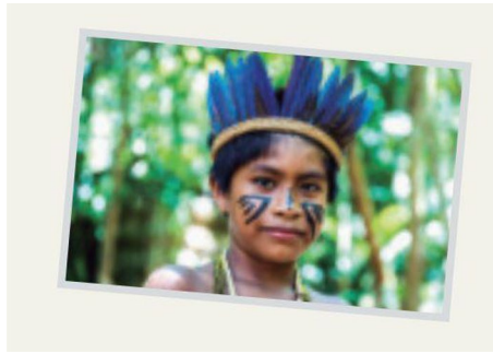
Fig. 4 Indigenous Peoples. From “Teens in Motion 2”, by Alvarado (2018, p. 13). Copyright Ediciones Cal y Canto