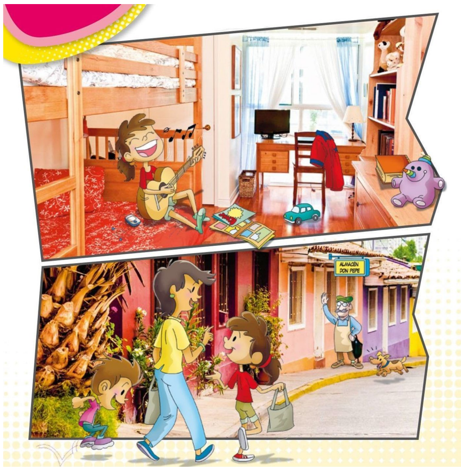
Fig. 10 We live here. From "English 5," by Miranda (2016, p. 52).