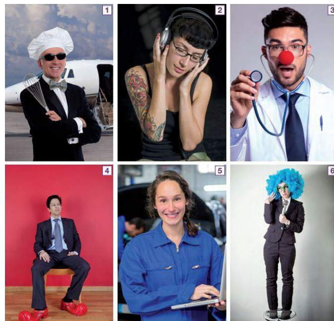
Fig. 11 Jobs. "Teens in Motion 1," by Polk-Reyes (2017, p. 21).