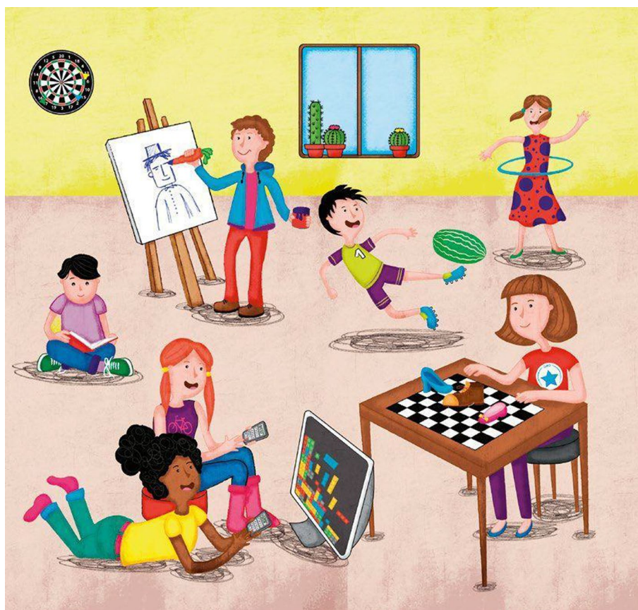
Fig. 9 My favorite activity. From "English 5," by Miranda (2016, p. 380). Copyright Ediciones SM Chile S.A