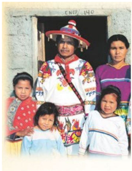
Fig. 3 Huichol. From “E-Teens 8”, by Curwen and Pontón (2013, p. 137). Copyright U.D. Publishing, S.A. de C.V

cultural stereotypes reduce the differences among individuals or groups to a predefined set of features (Holliday et al., 2010) (see Fig. 4).