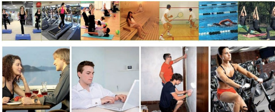
Fig. 14 Fitness gym. “Global English,” by J. Polk-Reyes (2018, p. 127).