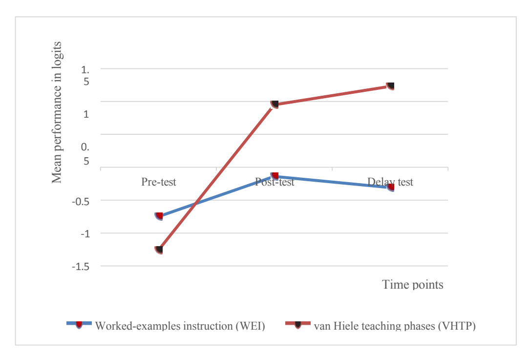
Figure 3. Line graph showing a summary of students' overall performance at each time point

points (hypothesis 3). The Mauchly's test confirmed that sphericity is assumed (p = 0.07) and the result indicated that significant difference exists between the WEI and VHTP across the three time points, with a very large effect size [F(2, 308) = 153.30, p = 0.00, \eta^2 = 0.50 ]. A summary of the effectiveness of the two interventions from pretest to post-test then to delay test is shown in Figure 3.