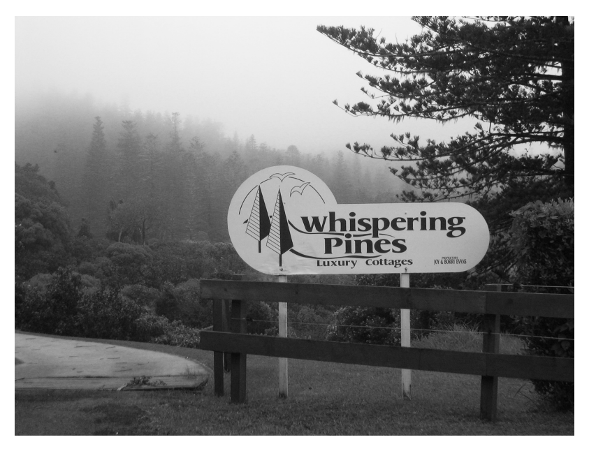
Figure 3. Whispering Pines Luxury Cottages.

linguistic landscape: Names are both accurate and inexact, as culturally stringent as historically wayward. An example from 2008 illustrates my point: Several tourists spoke adamantly and convincingly to me atop Mount Pitt, the island's highest peak, about how they thought it was amazing that the Bounty had made it to Norfolk Island. The Bounty was burned on Pitcairn Island shortly after the mutineers and the Polynesians arrived in 1790.