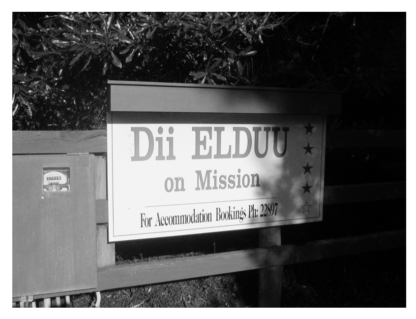
Figure 1. Dii Elduu.