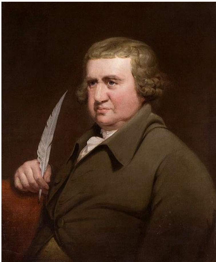
Figure 2. 'Erasmus Darwin' (1792) by Joseph Wright of Derby (oil on canvas)

My first suggestion consists of two intertwined points: poetry provided the imaginative medium for Darwin's scientific conjecture and imaginative scenario was the sugary coating that allowed Darwin to feed his scientific and technological ideas to the populace. Section I of this paper will address this suggestion as it pertains to Darwin's first long poem, The Botanic Garden with emphasis on Part I, 'The Economy of Vegetation'. The Botanic Garden with its complex imaginative structure best exemplifies Darwin's weaving together of scientific observation and innovation with phantasmagoric characters and settings. By entertaining the populace with stunningly crafted verses and amusing preternatural persona, Darwin made his notions palatable to a wide audience and thereby broadcast his scientific speculation. 6