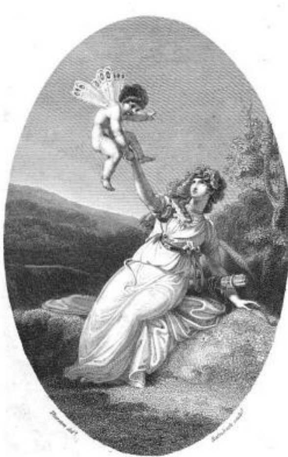
Figure 1. 'Flora at Play with Cupid' from The Botanic Garden

official and professional treatise? In other words, what special advantage did Darwin recognize that poetry presented for swaying the public toward his scientific assertions?