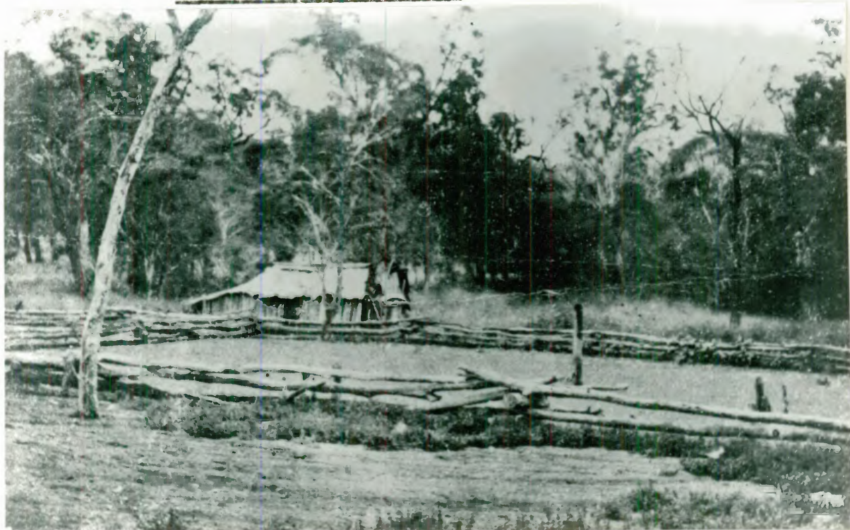
SLAB AND BARK SHEPHERD'S HUT on a run at Segenhoe. Note the chock-and-log sheepyard. A rare glimpse of pioneer life from an early photograph. c.1860, among papers from Roumalla, Uralla.