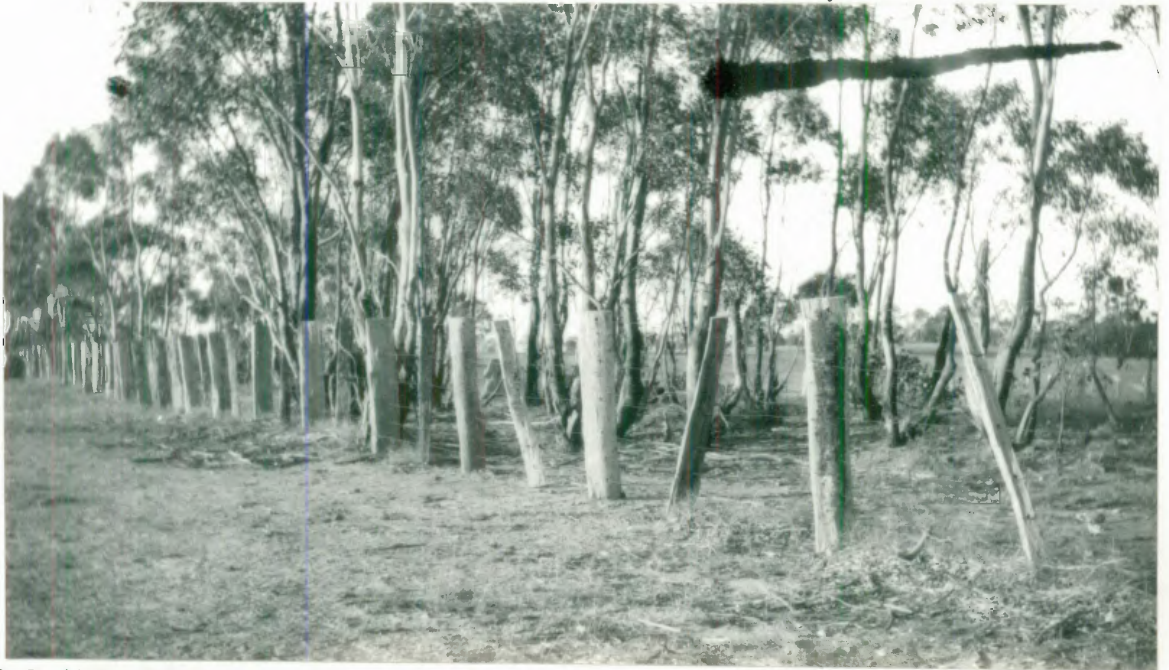
28 Sept. 1968 at Ulmarra, near Grafton.

POST-AND-DROPPER FENCE . When posts were scarce, the traditional 9 ft. panels were extended, and light batons or 'droppers' were interposed to stabilize the wire. This was especially necessary when early soft "black" wire was used. The droppers also made the fences more obvious to stock.