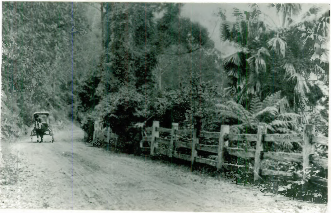
POST-AND-RAIL FENCE along the Bulli Pass road, 1898. Note the Cabbage Tree Palm and Tree Fern, remnants of the great Illawarra "cedar brush".