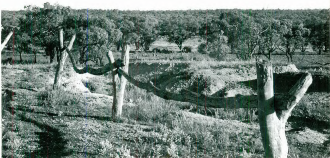
FORK AND RAIL FENCE of Mallee, 25 m. west of Euston. Mallee scrub in background.