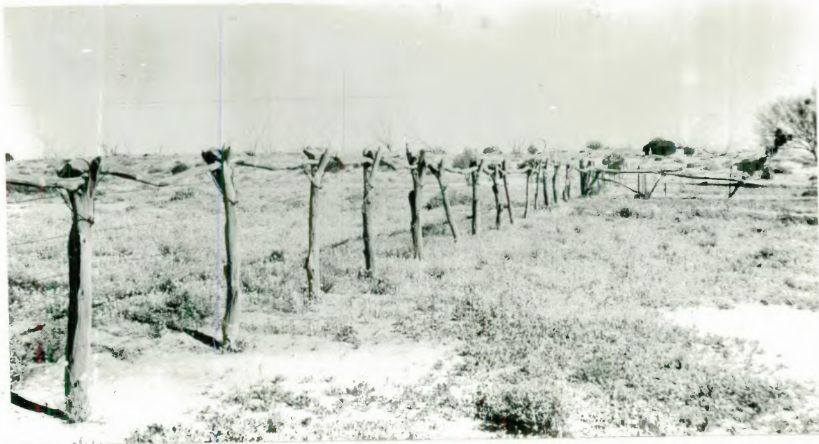
FORK AND RAIL FENCE of Mulga, Acacia aneura , with six strands of 'black' wire, near the Bulloo River Overflow, east of Tibooburra. Mulga trees, mainly dead, in background.