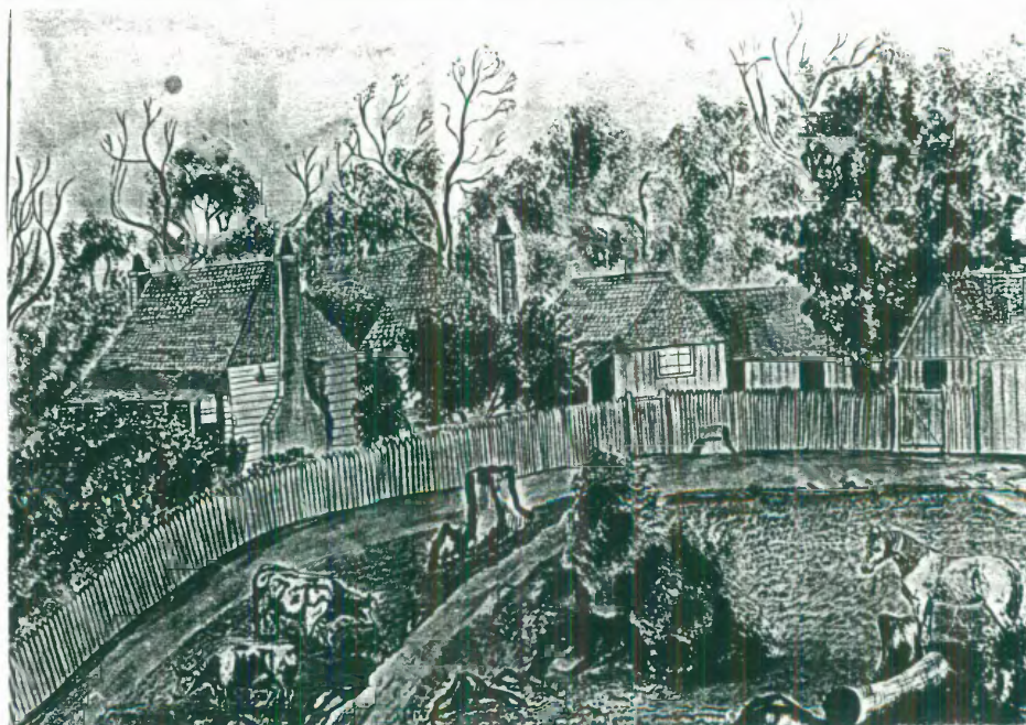
LINDESAY HOMESTEAD, 1877, a complex of slab and weatherboard structures, all with shingled roofs, (hipped except for the store on the extreme right.) The lefthand weatherboard building is apparently the most recent, being added in front of an earlier slab structure which may then have become a detached kitchen.