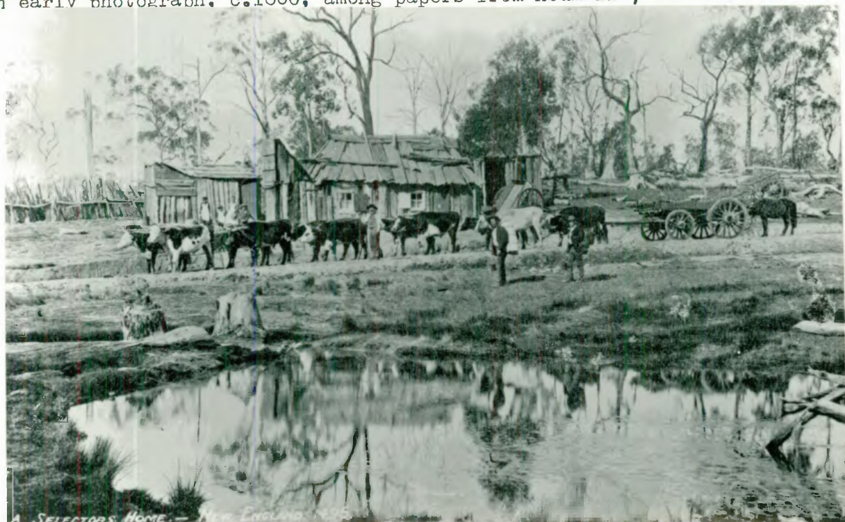
SLAB AND BARK HUT of stringybark, probably Broad-leaved Stringybark, E. caliginosa . c. 1895, used by J. H. Maiden in Forest Flora of N.S.W. , VI, to show the use of stringybark in New England.