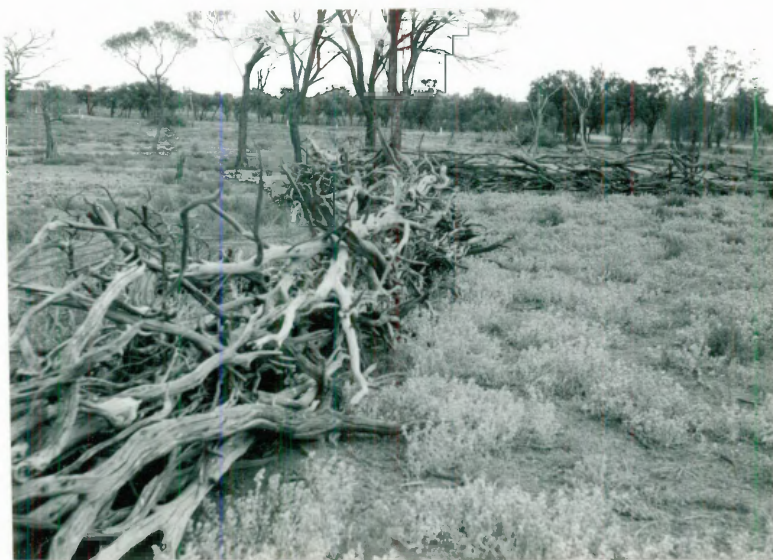
May 1968, 73 m. west of Bourke.

BOUGHYARD of Mulga branches enclosing a pasture of salt-bush.