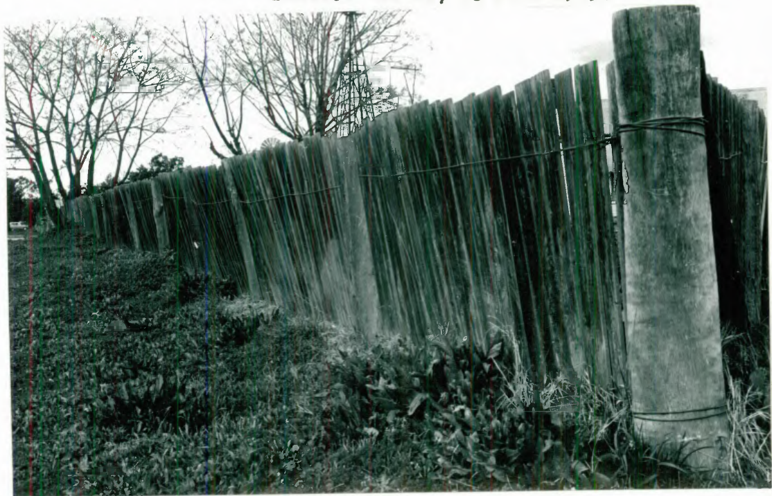
SAWN PALING FENCE of White Cypress Pine, Callitris hugelii . In this backyard fence, the palings are supported by strands of fencing wire, not nailed to rails.