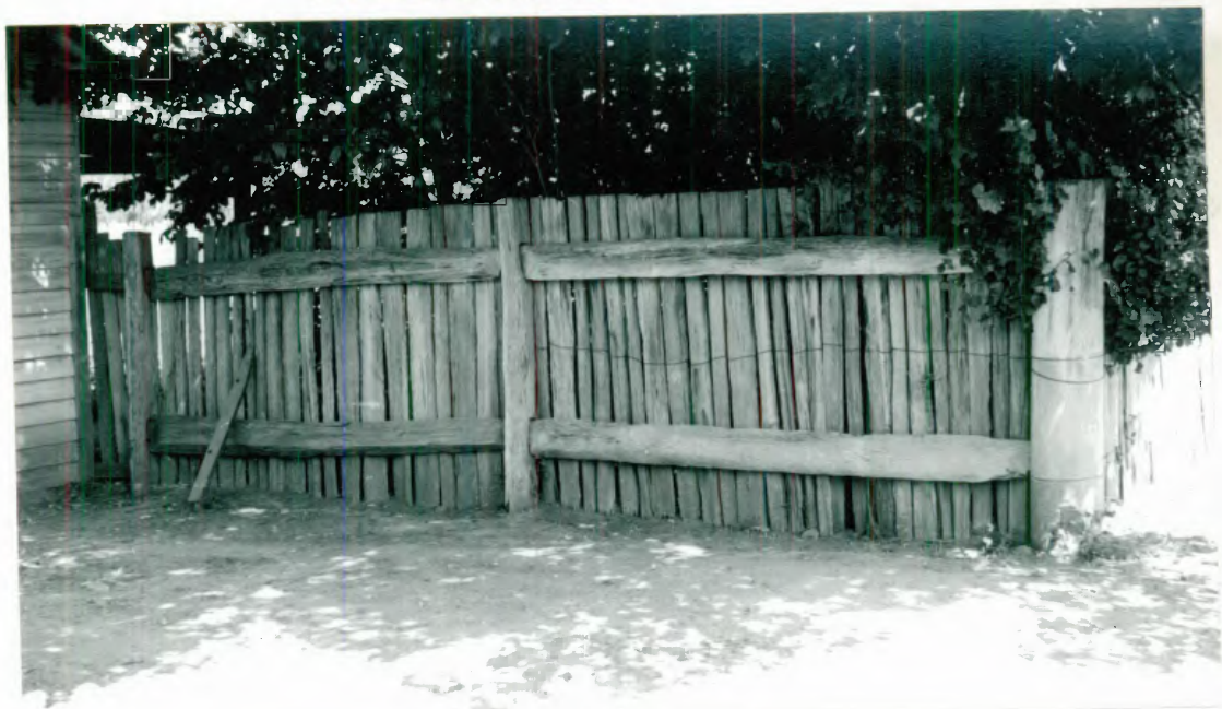
POST-AND-RAIL FENCE CONVERTED TO SPLIT PALING FENCE, The Armidale School, Armidale.