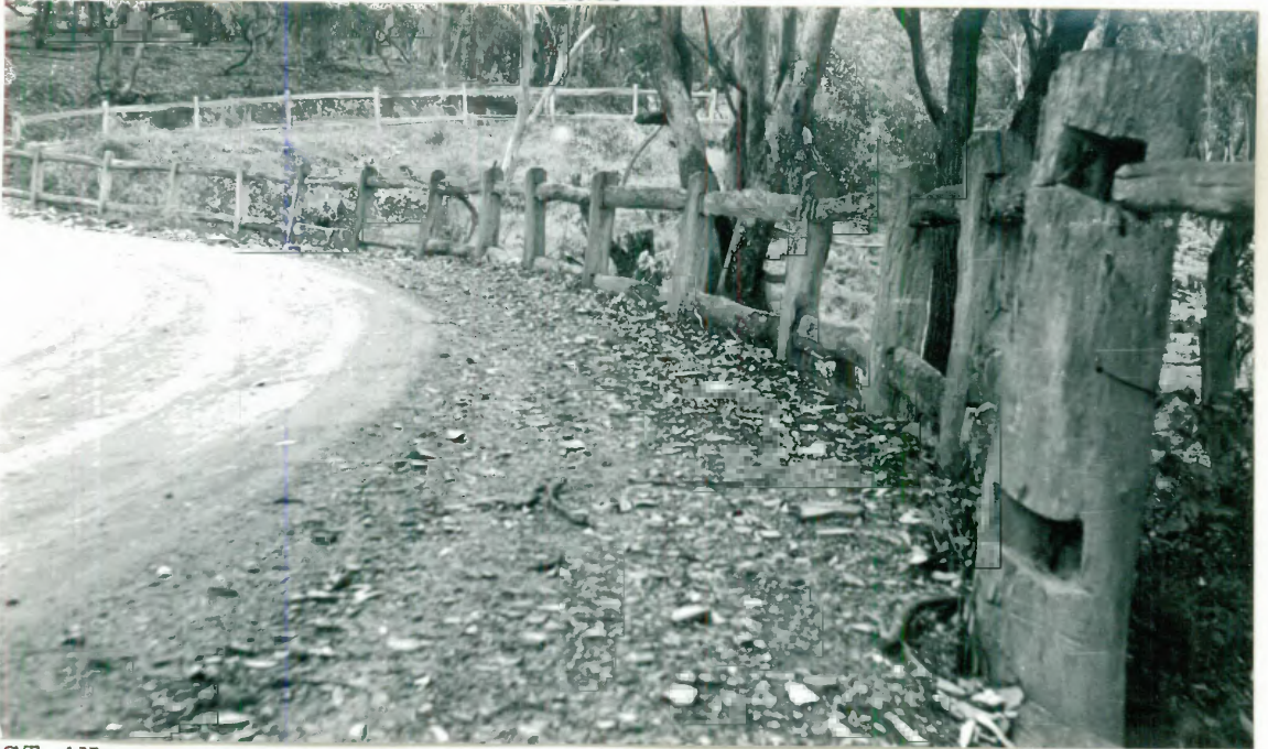
POST-AND-RAIL FENCE bordering the road between Sofala and Hill End. William Cox built similar fences along the more hazardous sections of his Blue Mountains road, 1814-1815.